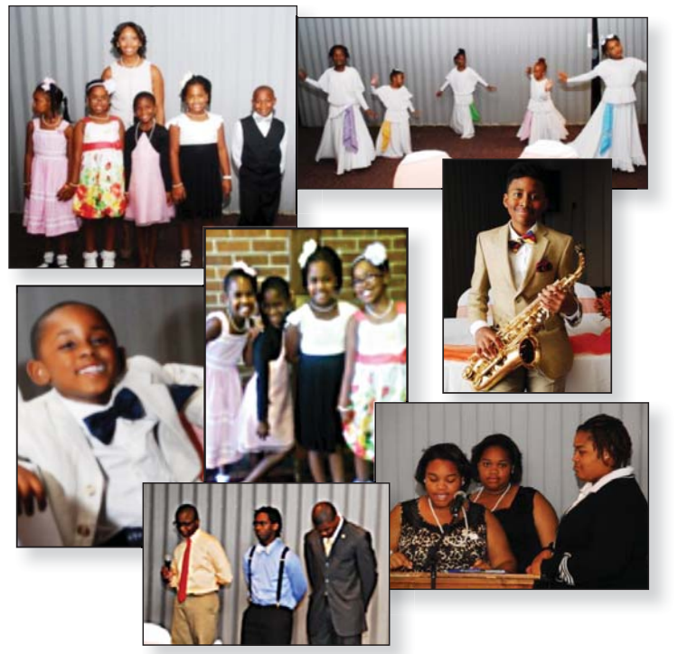
Back to School Festival

Bow Ties and Pearls...Brunch with Pastor