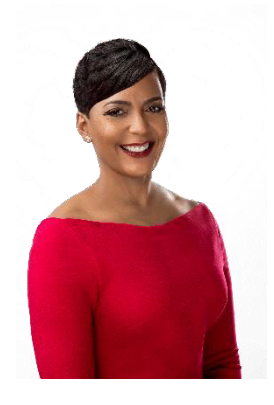
KEISHA LANCE BOTTOMS MAYOR