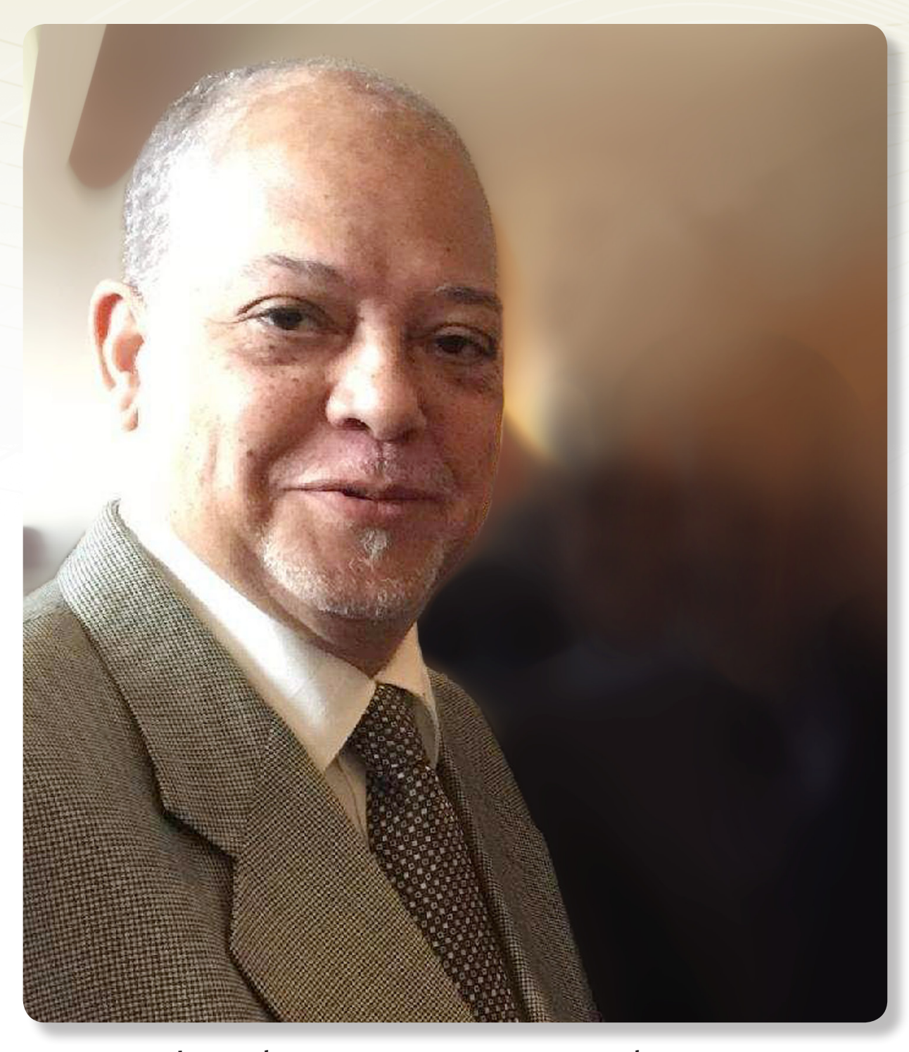
Sunrise - July 10, 1956 • Sunset - September 8, 2018