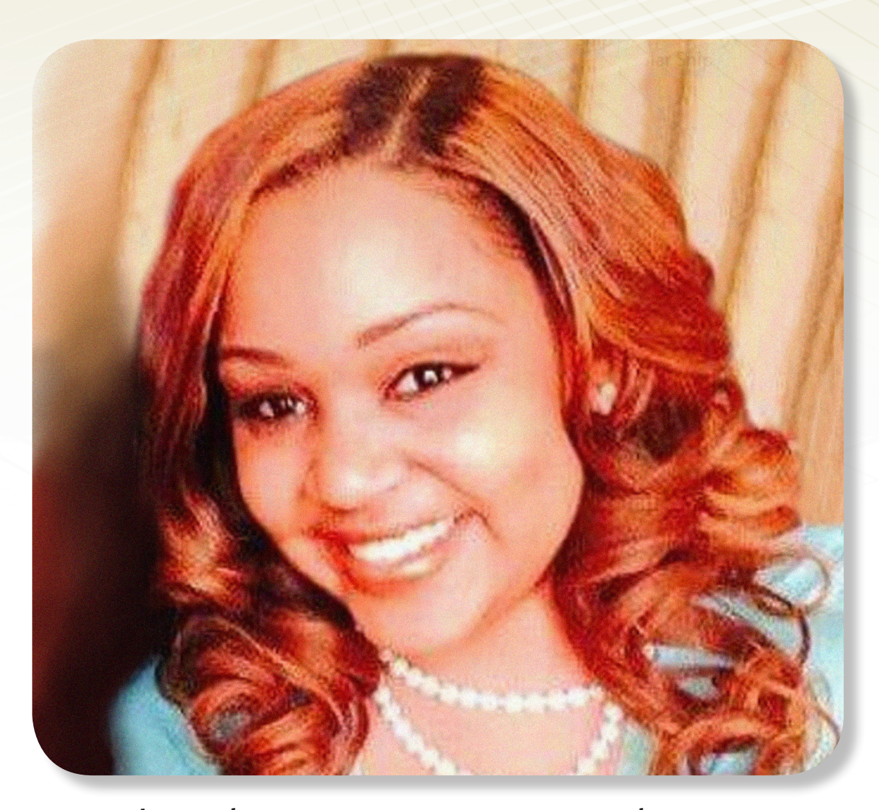
Sunrise - July 10, 1986 • Sunset - September 10, 2017