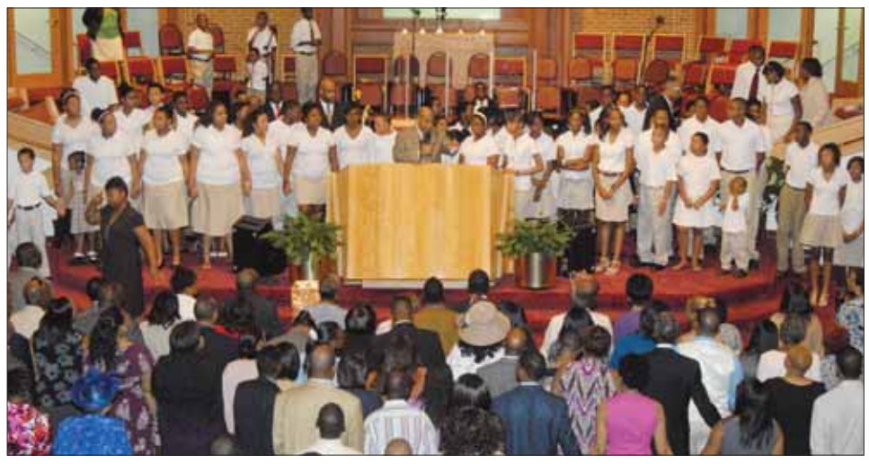
Youth Division Culmination