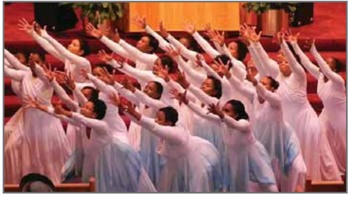
Antioch Vessels of Praise Dance Ministry

Praise was founded in tioch worship experience 2000, adult members of the congregation were given an opportunity to incorporate dance as ministry during Sunday worship services and special events at Antioch. The Youth Dance Ministry was organized in 1997, but no similar outlet existed for adults to use dance and mime as a part of the An-