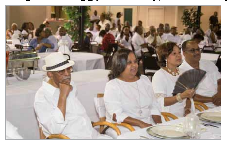
Enjoying the birthday celebration

The White Affair that was a surprise birthday party.