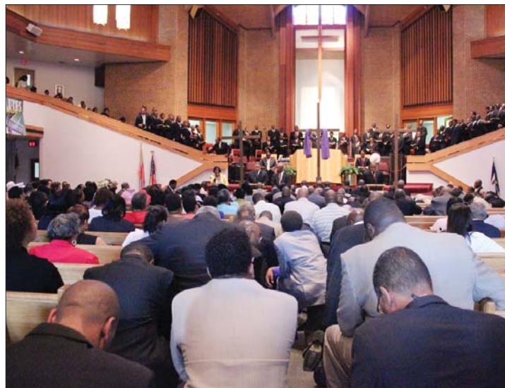
The Men of Antioch kneel at the cross.