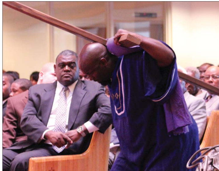
"Men of Antioch, Bearing the Cross of Jesus"