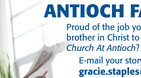
works with the youth at Antioch Baptist Church North.