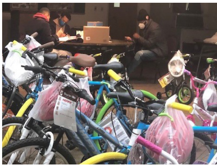
Antioch Baptist Church North made sure Christmas 2020 was merry and bright for hundreds of children, thanks again to the generosity of her members.