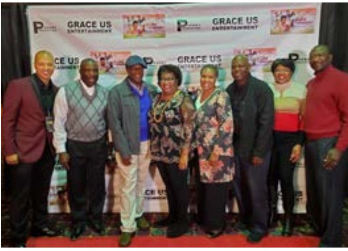
UCAN members gather for a photo at the event

"You'll never be perfect, nor will your marriage, but