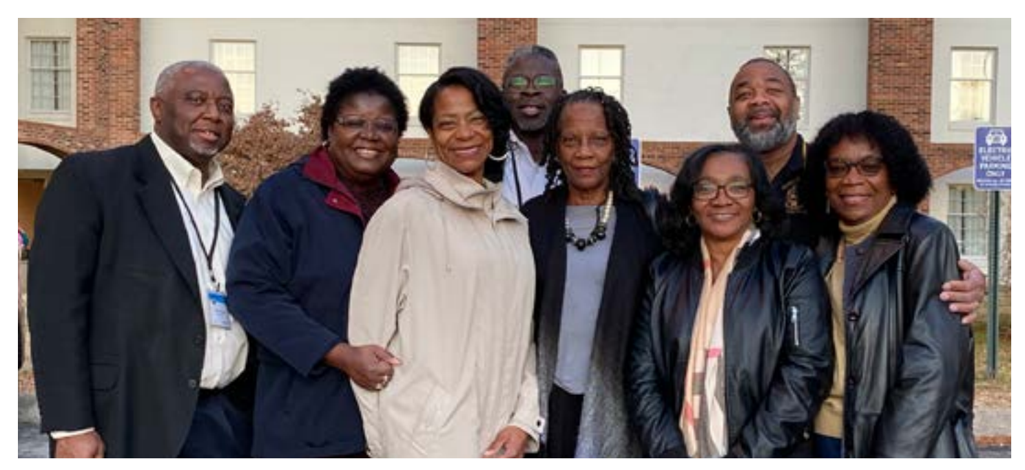
Antioch Delegates to the Sunday School Publishing Conference held December 3-4, 2019

Following the program, parents who otherwise would not have been able to provide toys for their children on Christmas were able to go from room to room to select age-appropriate toys for their children. The toys were donated by Antioch members, and the Women's Ministry spent weeks sorting and wrapping the gifts that were provided to over 300 children.