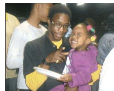
The children are excited.

It was hard to tell who was more grateful – the children or their parents.