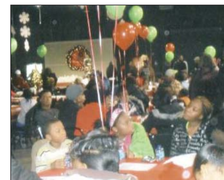
Children and parents gather for community Christmas