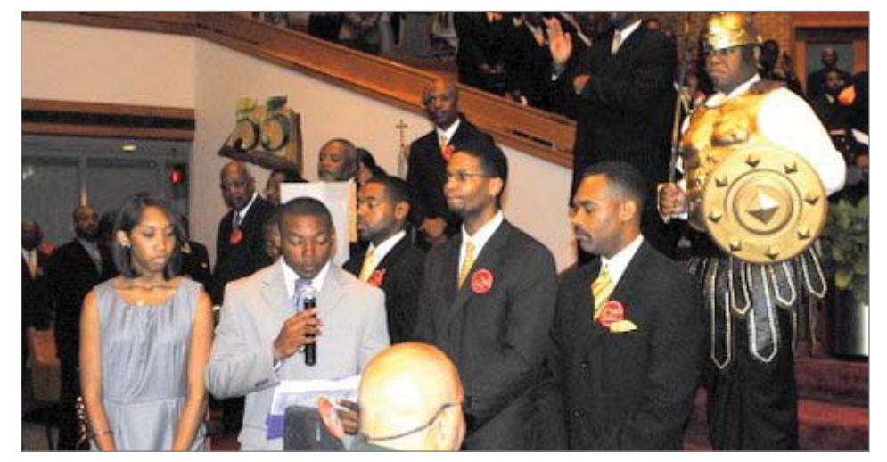
Passing the torch

moments of the 8 a.m. service, the men demonstrated putting on the whole armor of God – girding a brother with the