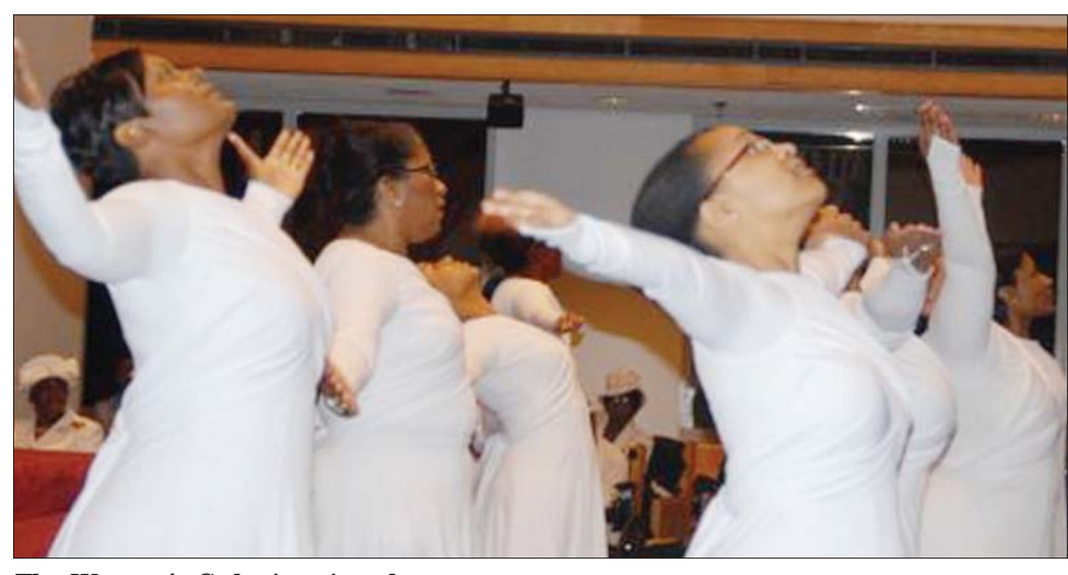
The Women's Culmination dancers