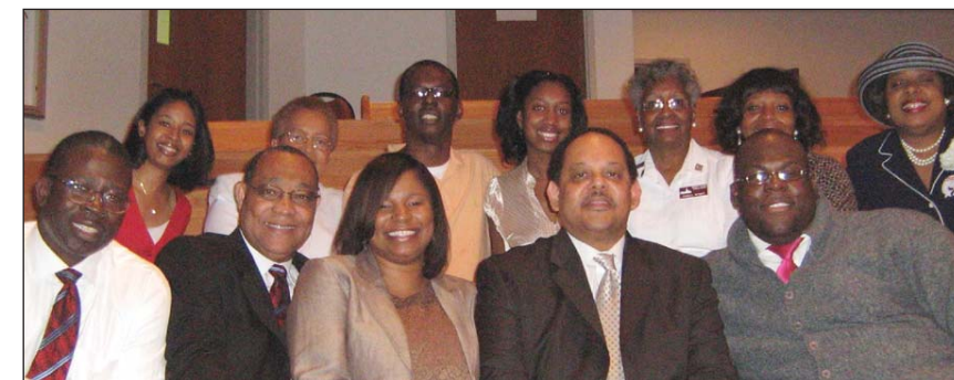
A few members of the July Birthmonth Club

But July is taking it a step further and combining service and fellowship. Instead of birthday gifts, everyone will donate items to be given to an outreach