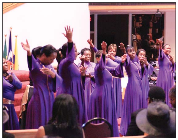
(W.I.S.E.) Women's Inspirational Senior Ensemble performs during the Women Division Culmination.

The stirring service marked the end of three months in which the wom- Continued on page 3