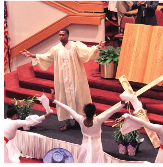
Antioch members' Easter presentation