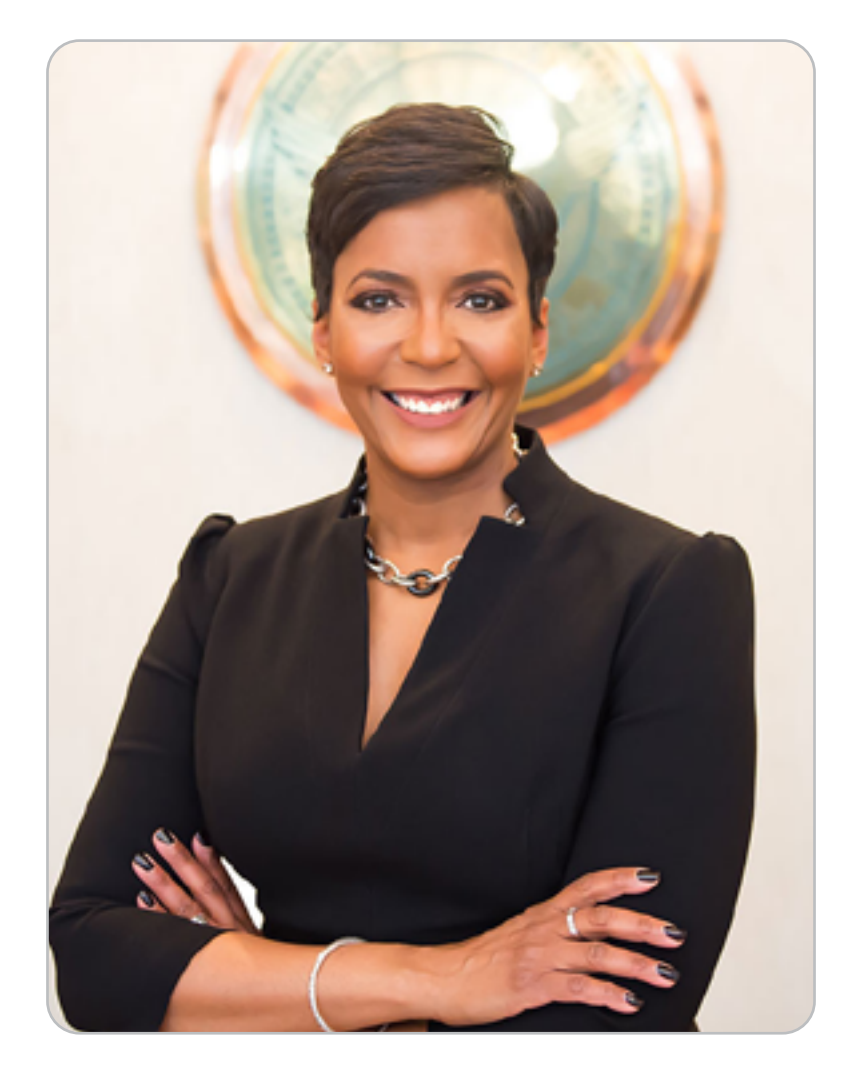
Congratulations from The Honorabe Keisha Lance Bottoms